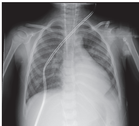
FIGURE 3: Follow-up radiograph. Improvement in pulmonary disease from previous image five days following admission and treatment. Mild perihilar consolidation persists with basal atelectasis.

severe respiratory compromise that quickly resolved with a short course of systemic corticosteroids, and CRRT.